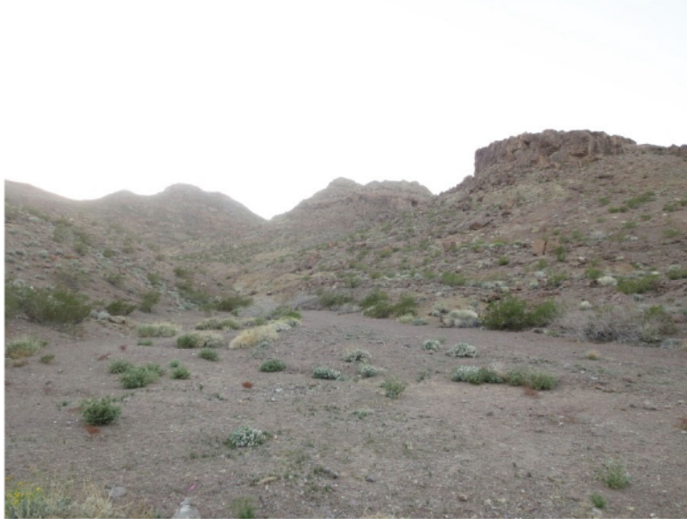
Figure 1 - View of the trail as users start to climb in elevation