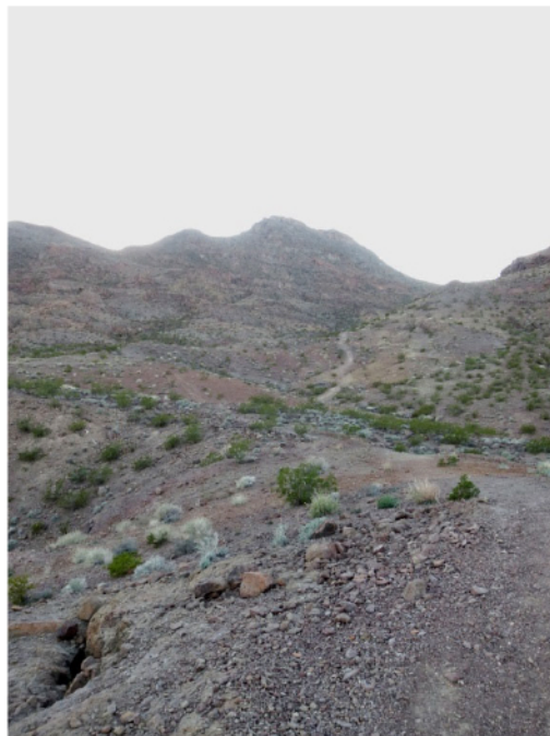
Figure 2 - View of trail and surrounding area as trail users ascend to the plateau of the trail