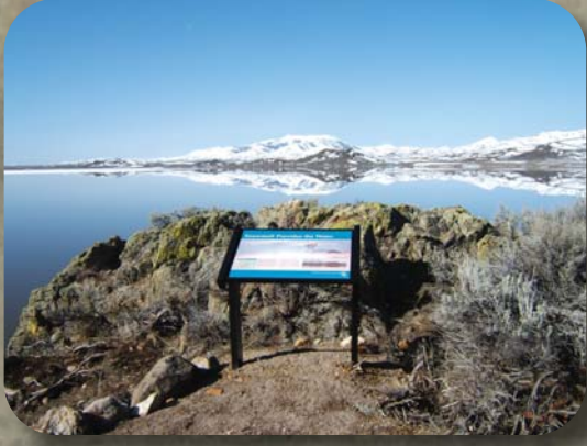
Wild Horse Loop Trail

Mountain City - 18 mi Owyhee - 35 mi Elko - 65 mi