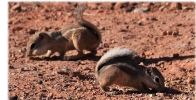
White-tailed Antelope Ground Squirrel

Permit required for commercial photography. Apply online at least 6 weeks in advance.