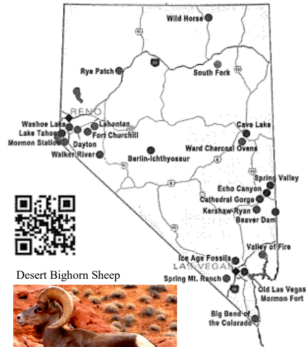
Desert Bighorn Sheep